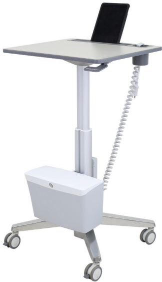
Basic mobile carts

Thoroughly review diagnostic results sitting or standing with ergonomic monitor arms, wall mounts and medical carts. The flexible designs fit a variety of spaces and easily adjust to accommodate clinicians across different shifts. The ability to support multiple screens allows users to simultaneously handle several cases remotely for timely, accurate evaluations.