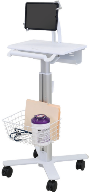
Light-duty medical carts