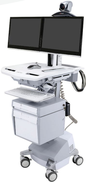
Full diagnostic carts